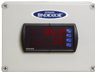
PRD1000 in NEMA 4X Enclosure